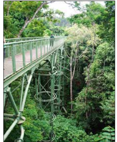
Rainforest Discovery Centre

Day 2 and 3: Transfer to Sepilok Orangutan Rehabilitation Centre to see orangutans, then Borneo Sun Bear Conservation Centre to see sun bears. Lunch, then transfer to Labuak Bay Proboscis Monkey Reserve to see proboscis monkeys, silver leaf monkeys and (often) oriental pied hornbills. Long-tailed macaques are often spotted around the Sepilok area. Transfer back to Sepilok Jungle Resort for dinner and overnight.