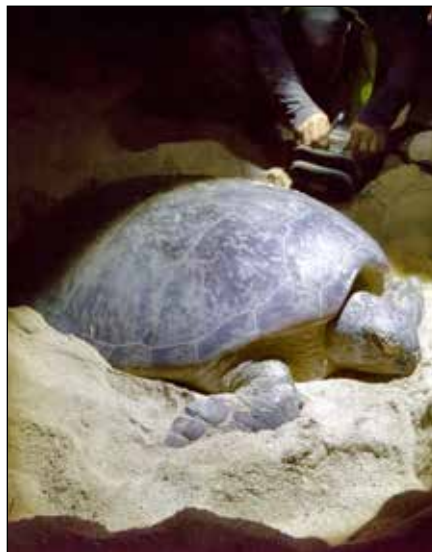
Female turtle laying