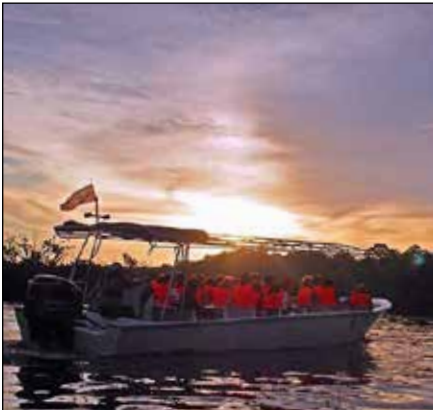
Sunset Klias River cruise

We arrive in Kuala Penyu just before sunset to do a cruise along the Klias River to see proboscis monkeys and macaques in the trees along the river banks. We have dinner in a river-side restaurant, then return to the boat for a night time river cruise to see fire flies (the fire flies synchronise their flashes, so entire trees can light up). Accommodation in a hotel at Kuala Penyu.