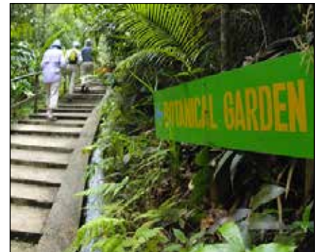
Cloud forest trails