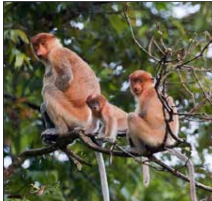
Proboscis monkeys on Klias River