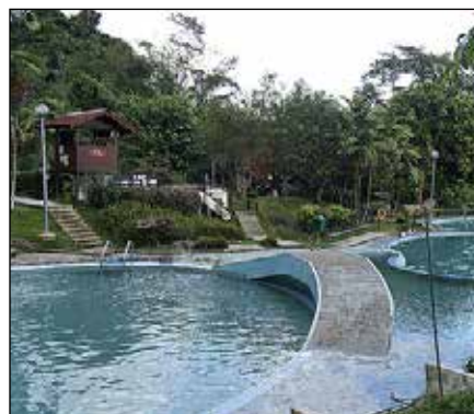
Poring Springs geothermal pools