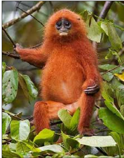
Red leaf monkey