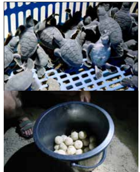
Release baby turtles & egg collection

Day 6: Transfer back to Sandakan for connecting flight to Kota Kinabalu. Transfer to Poring (close to Mount Kinabalu). Depending upon our arrival time, we can undertake some of tomorrow's activities today! Accommodation in a hotel at Poring. Dinner in a local restaurant.