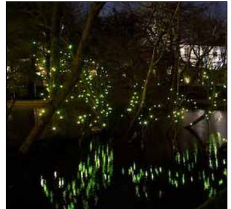
Fire flies on Klias River

Day 10: This morning, we transfer to Survivor Island (Pulau Tiga Resort), so called because the TV series “Survivor” was filmed here. A beautiful coral island with sandy beaches and reefs. During the rest of today, and all of tomorrow, we can undertake the following activities: