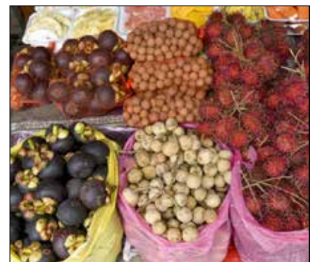
Kundasang fruit market