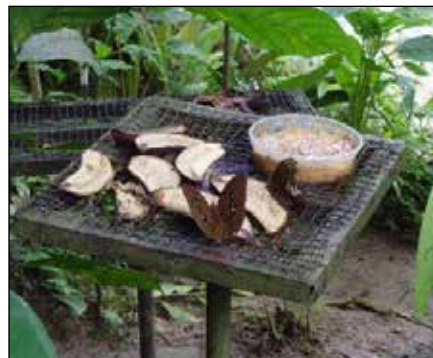
Poring Springs butterfly garden