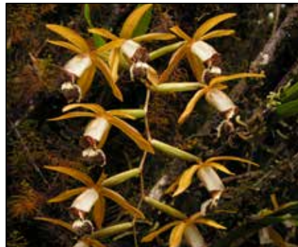
Orchid in the botanic garden