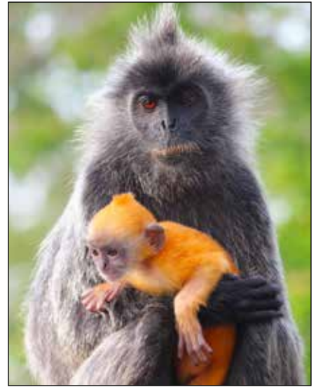
Silver leaf monkey

Day 4: Early morning transfer by boat to a beautiful coral island called Selingan (known as Turtle Island). Selingan has nice, sandy beaches, with coral and marine life offshore. The Philippine megapode and 1 m long Asian water monitor lizards are frequent sights within the open forests on Selingan. On arrival, we have an information briefing and video presentation, followed by dinner. Late at night we (hopefully) watch green and hawksbill sea turtles laying eggs on the island's beaches. We may also witness a release of hatchlings (by wardens) into the sea. Note: turtles cannot be guaranteed - landings happen throughout the year but can be unpredictable. Overnight in accommodation on Selingan and dinner in the island's restaurant.