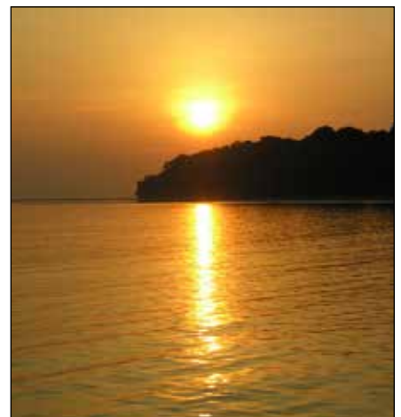
Sunset on Survivor Island