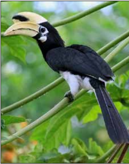
Oriental pied hornbill