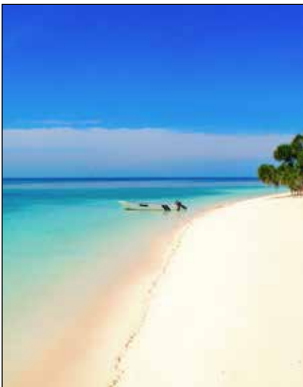
Selingan Island (Turtle Island)

Day 5: A relaxed day on the beaches of Selingan Island and a second opportunity to see the turtles tonight (in case not many turtles came ashore last night). Explore the island and undertake nature walk to see wildlife! Overnight in accommodation on Selingan and dinner in the island's restaurant.