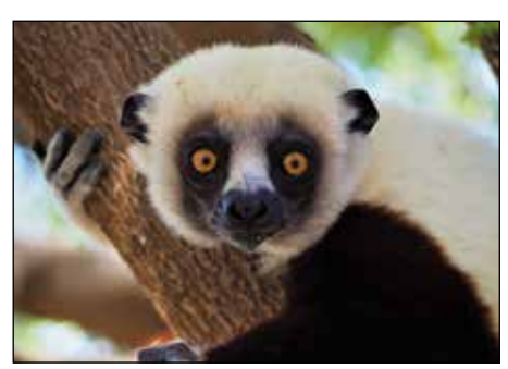
Day 15: Return to Antananarivo

A final long drive (6-7 hours) but scenery is beautiful and there are many endemic plants that can be seen along the road. We learn more about local lifestyle and culture as we will pass through small villages. We arrive back in Antananarivo around sunset. Overnight in a local hotel and dinner in a local restaurant.