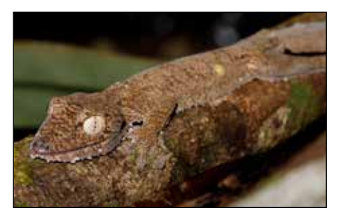
Day 2: Andasibe-Mantadia National Park

After breakfast, we visit Andasibe-Mantadia National Park and walk on trails to see many wild lemurs including diademed sifakas, woolly sifakas, common brown lemur and the famous Indri (the biggest lemur of all), as well as orchids and birds. Sightings are usually close up with the animals just a few metres above us in the trees. During the afternoon, we can undertake walks along nature trails and visit birding locations. Dinner in a local restaurant. Accommodation at a resort or hotel nearby.