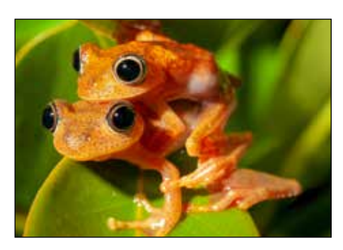
Day 3: Andasibe to Pangalanes Canals

After breakfast, we visit the Vakona private reserve and go to "lemur island" (a small island in a river), where habituated (rescued and relocated) common brown lemurs, grey bamboo lemurs and black-and-white ruffed lemurs live for very close encounters (they often jump on your shoulders). We can visit the Vakona zoo (home to a fossa, crocodiles and other native animals). After lunch, we have a long drive, passing through groves of traveller's palms, we arrive at Brickaville and enter the Pangalanes Canals, reaching Palmarium.