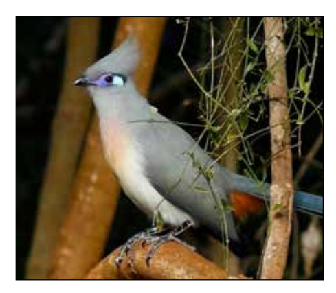
Day 8: Berenty Reserve to Fort Dauphin

After breakfast, we begin the drive back to Fort Dauphin. Depending upon our arrival time, we can drive for a short distance to the north to see vast populations of the endemic pitcher plant Nepenthes madagascariensis in a preserved wetland, as well as (with luck) ring tailed lemurs. Dinner and overnight in local hotel.