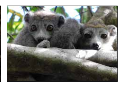
Day 13: Blue-Eyed Black Lemurs at Ambodimanga

Drive to Antsohihy (6-7 hours) but scenery is beautiful and we will be able to stop at Ambodimanga forest trying to find the very rare blue eyed black lemurs. The colourful panther chameleon can also be seen around Ambanja and Antsohihy. Overnight in a local hotel and dinner in a local restaurant.